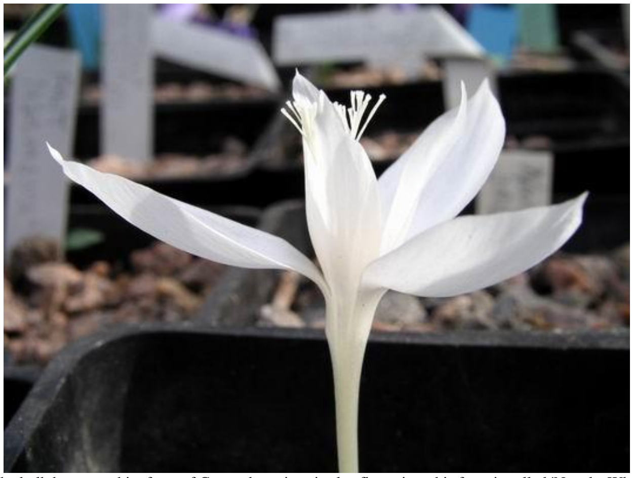
In the bulb house a white form of Crocus banaticus is also flowering, this form is called 'Novaks White'.