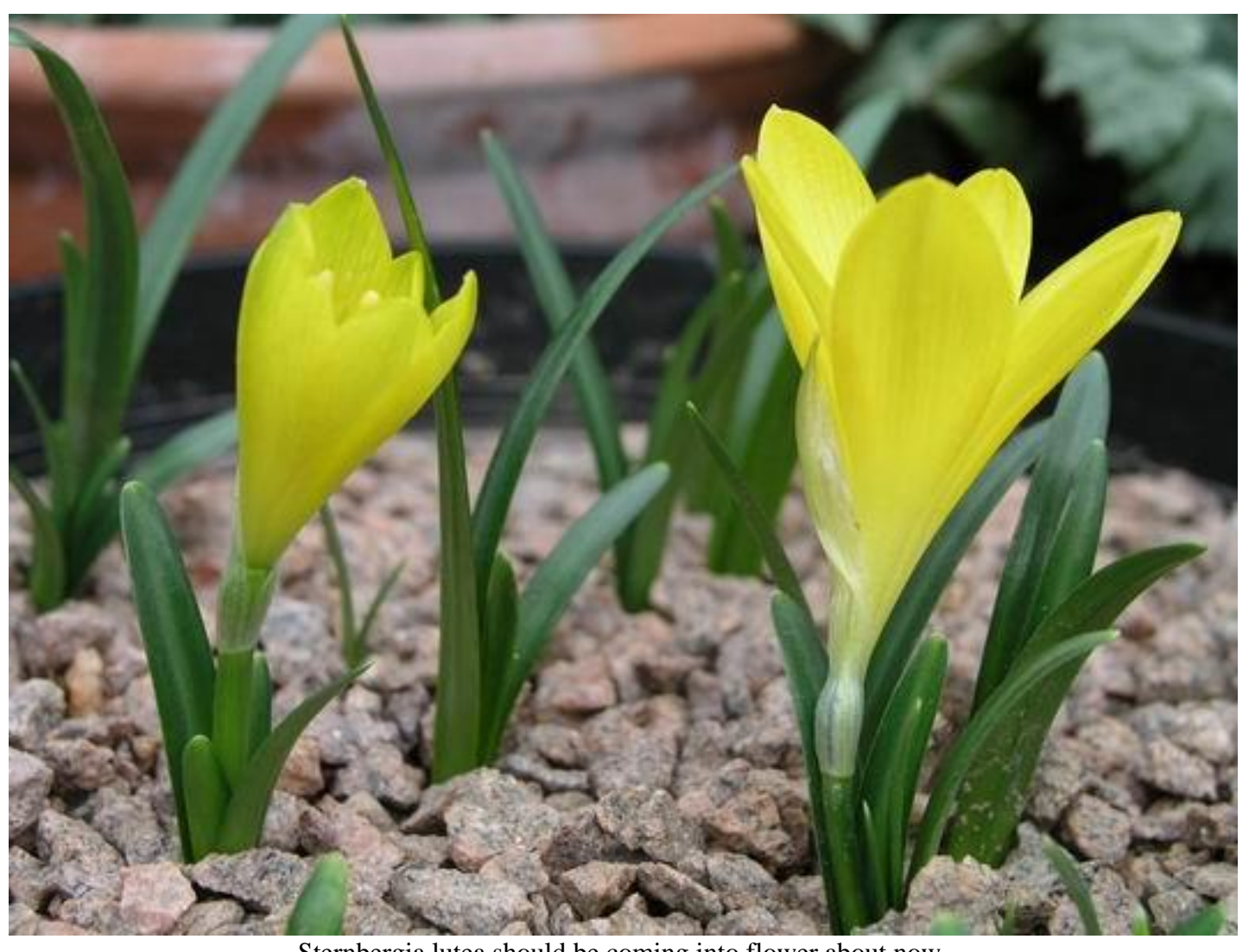
Sternbergia lutea should be coming into flower about now.