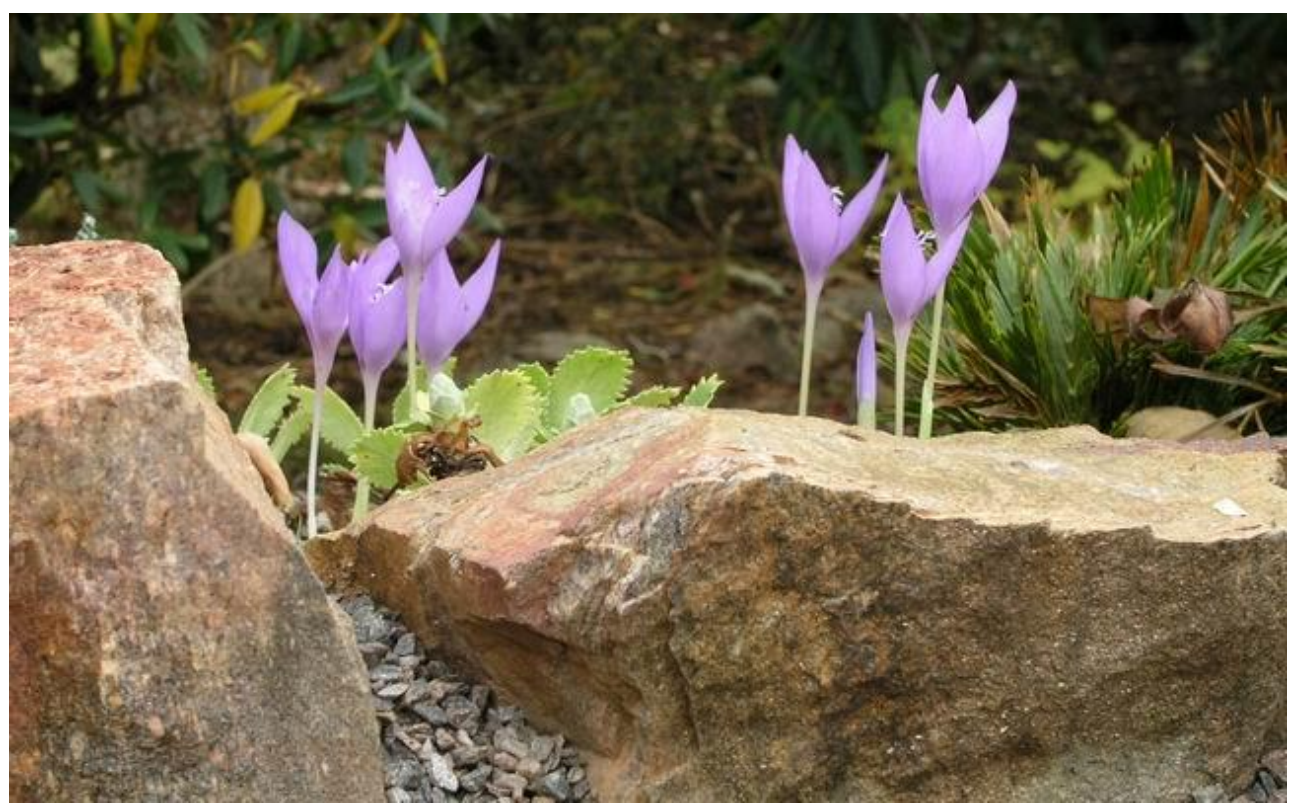
A group of Crocus banaticus flowering in one of the rock garden beds.

Nerine bowdenii is perfectly hardy in our garden even though it hails from South Africa. It is a plant that likes its bulbs sticking half out of the ground to perform well and flower. If you are planting do not bury them too deep or they will not flower until they have made their way back to the surface. This is a change as I am usually banging on about planting your bulbs deeply – there is always the exception to the rule.